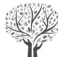
IDEFORD MILLENNIUM GREEN

The ground work for the new storage unit on the Millennium Green is due to start in early June. It will be necessary to close the Green for a couple of days while the diggers are working, hopefully this shouldn't be for long.